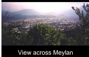
View across Meylan