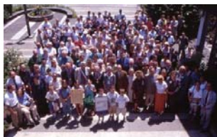
A previous twinning visit