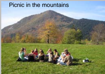
Picnic in the mountains