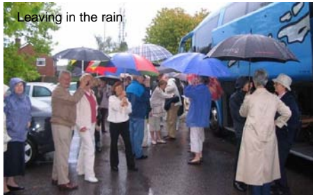
Leaving in the rain

Saturday evening saw the culmination of all of the hard work coming together for a dinner in the stylish 'Brookes on the Park' restaurant. An aperitif of prosecco and elderflower cordial tested the vocabulary of many hosts but finally the word went round that the flavouring was 'sirop de sureau'. There followed an excellent dinner based on the best of local ingredients and, if the beer with the pate was a shock to some, the rest of the meal went down very well.