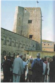
Oxford Castle visit