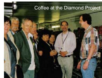
Coffee at the Diamond Project

This was certainly the case for our visit to the new Diamond Light Source at Harwell. We were welcomed with a much needed coffee in the magnificent atrium and then introduced to the scientific capabilities of the new Diamond facility. Our visitors were delighted to find that French scientists working on the project had been co-opted to provide a translation to accompany the slide presentation. During lunch, generously provided by the Diamond project, small groups were taken to view the building that houses the accelerator.