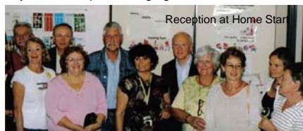
Reception at Home Start