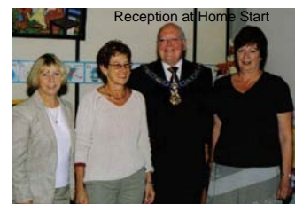
Reception at Home Start

artefacts to up to the minute racing car and include a 'ride' along the old Wantage tramway. Between the visitors, hosts and guides we shared some rather specialised vocabulary (anyone know the word for iron age hill fort?). Translation was also difficult when welcomed into the home of a local bigwig by a very talkative housekeeper, with a strong Berkshire accent, who wanted to tell us about the exploits of the young master on one of Nelson's ships. After an opportunity for a restorative cup of tea and some retail therapy, the group returned to Didcot in time to visit the Art Exhibition before dinner.