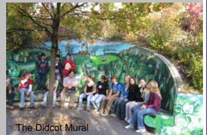
The Didcot Mural

The following day a tour of Meylan highlighted its impressive local facilities (theatre, music school, senior school, parks, halls), including a sundial (used to tell the time in Didcot) and a large mural of Didcot in a pedestrian underpass. A coach ride along hairpin bends took everyone into the mountains for a picnic and orienteering at le Sappey. The French and English children were put into teams, had to follow a route on a map, answer nature questions and get back to base as quickly as possible. The day was rounded off with an evening of games and challenges testing skills, creativity, taste, and knowledge of Europe.