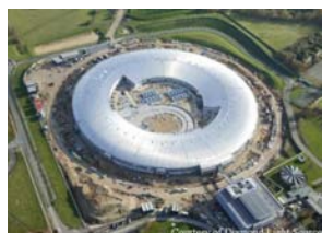
The Diamond Project