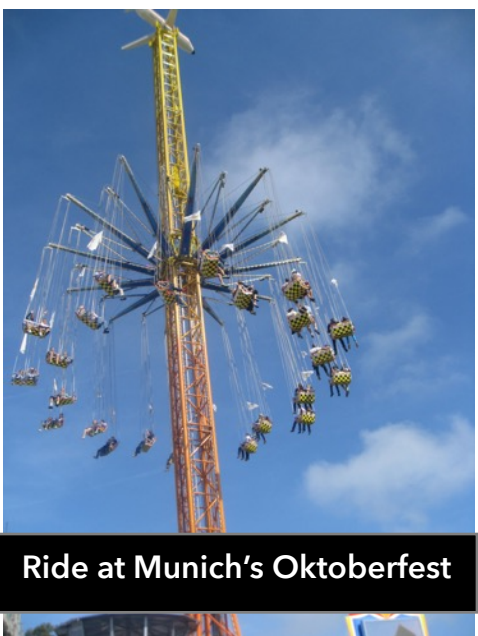
Ride at Munich's Oktoberfest