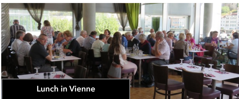
Lunch in Vienne

Anyone interested in getting involved with this visit should contact Sue Totterdell on 01235850080. If you can offer accommodation we would be delighted to hear from you.