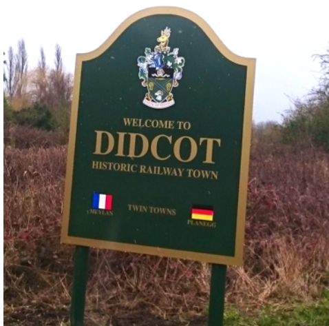
New town sign