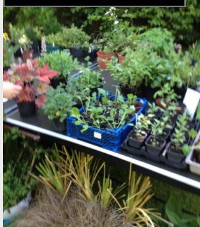
Previous plant sale

com@didcottwinning.org.uk tel: 01235850080