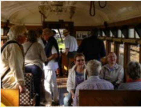
Restored train carriage