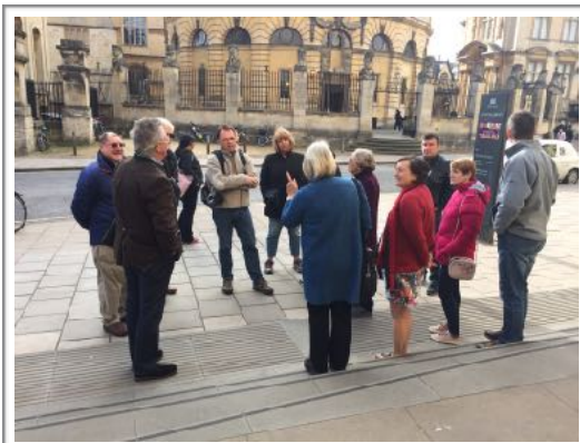
Oxford tour groups