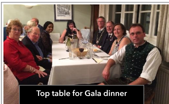
Top table for Gala dinner