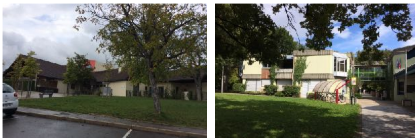
Two primary schools (above left & right) the Collège (below left) & Chartreuse Abbey (below right)

The visit was a great success in that it allowed face to face discussions and for materials to be exchanged directly. It is hoped that the schools involved will make the most of the Twinning visit to Meylan in 2018 to reinforce their links.