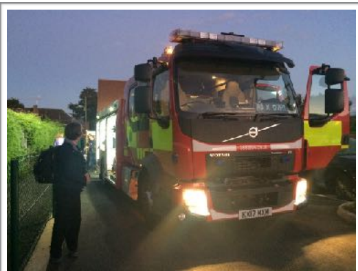
Visiting fire engine