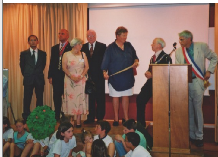
2000 in Meylan